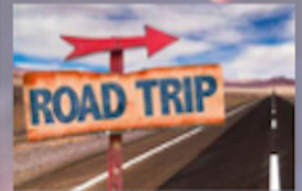
Sunday Road Trip Sunday, April 14th (Cost $20)

Small Groups (Sunday's @9:45am In the Student Wing Worship (Sunday's @10:45am In the Sanctuary) Midweek Worship (Wednesday's @6PM In the Student Wing)