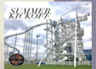
Summer Kickoff Saturday, May 23th (Cost $30)