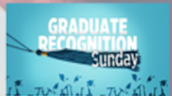
Graduation Recognition Sunday, May 5th