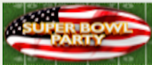
Super Bowl Party Sunday, February 3rd