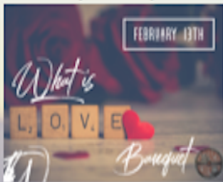
What is Love Banquet Wednesday, February 13th