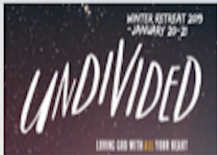
Winter Retreat January 20 th -21 st (Cost $40)

To provide a clean & sanitary kitchen for upcoming events, the kitchen committee seeks your help. Please sign up for job a assignment on the bulletin board in the foyer. The more help, the less time needed to clean on Saturday.